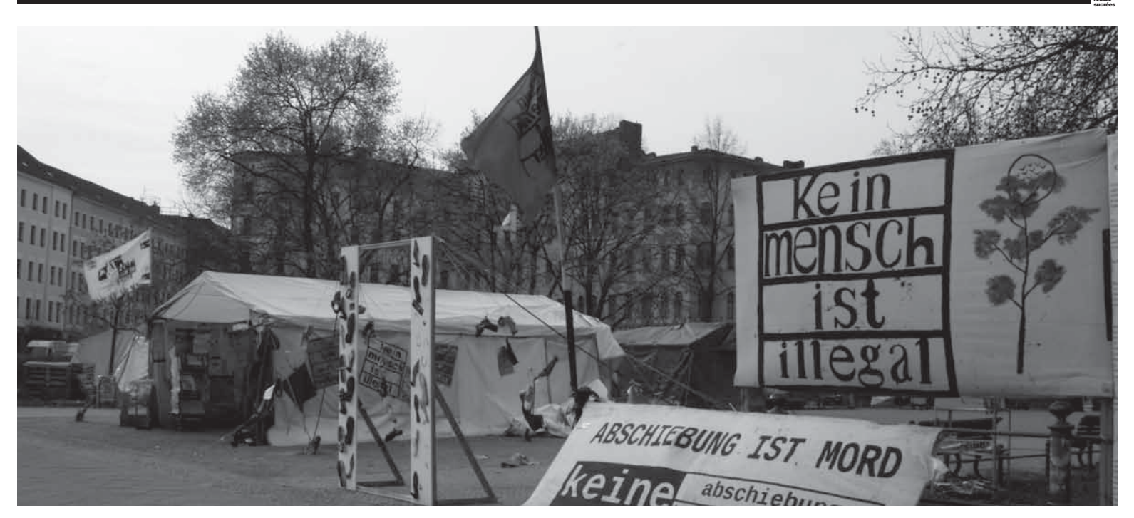
Photo of the refugee protest camp on Oranienplatz in Berlin-Kreuzberg, Germany. Slogan on the upper sign: No human being is illegal. Slogan on the lower sign: Deportation is murder.